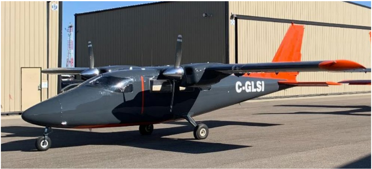
Figure 2: Fixed-wing aircraft equipped with LiDAR sensor and high-resolution camera for orthophotos.

Figure 1: Images showing infrastructure upgrades including road clearing, culverts, and multiple bridge installations giving year-round access to the Project. Bottom right, phase 1 camp established on the Atlantic Nickel Project site.